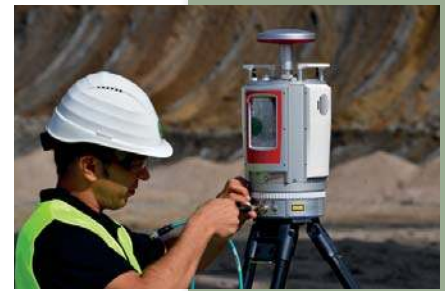
RIEGL VZ-2000i in the field