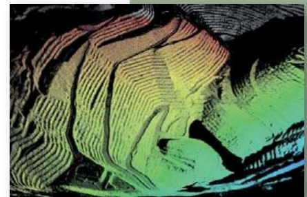
RIEGL VZ-2000i scan data, range-colored